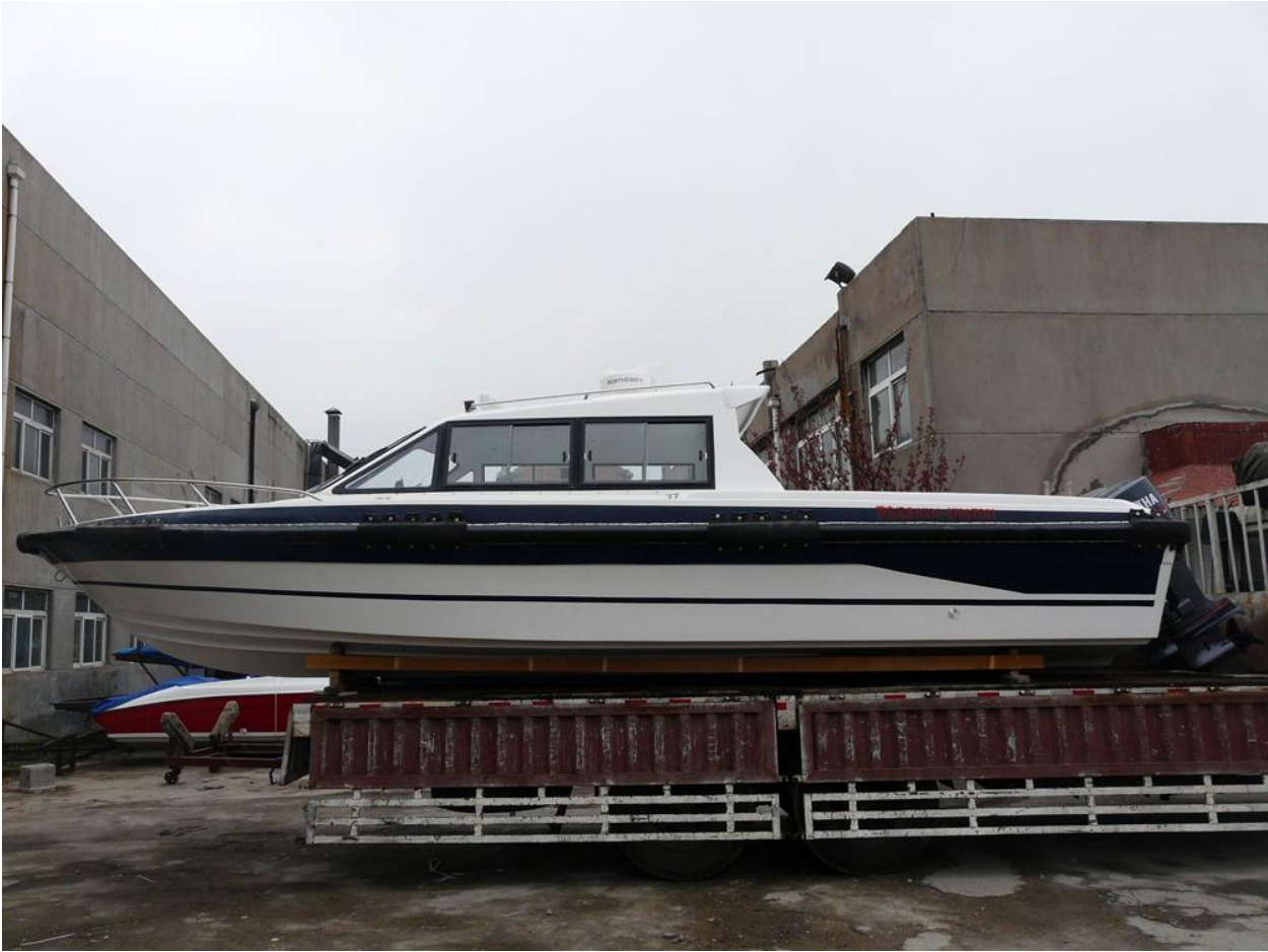
Side View 760/24'